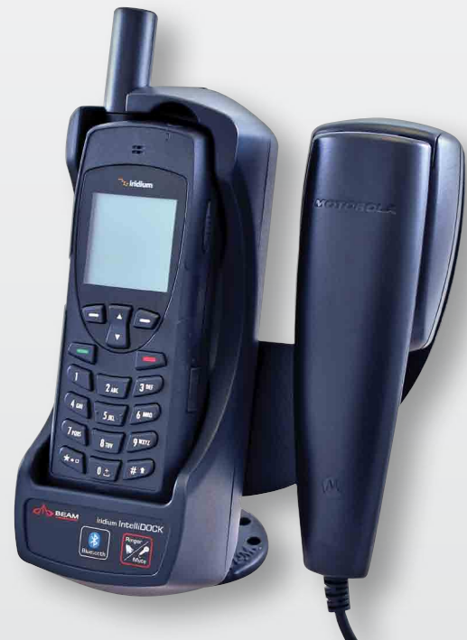
IntelliDOCK 9555 with optional Privacy Handset